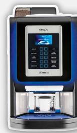
BEAN TO CUP