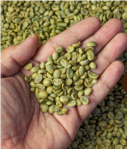
Fairly sourced, raw beans