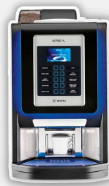
BEAN TO CUP